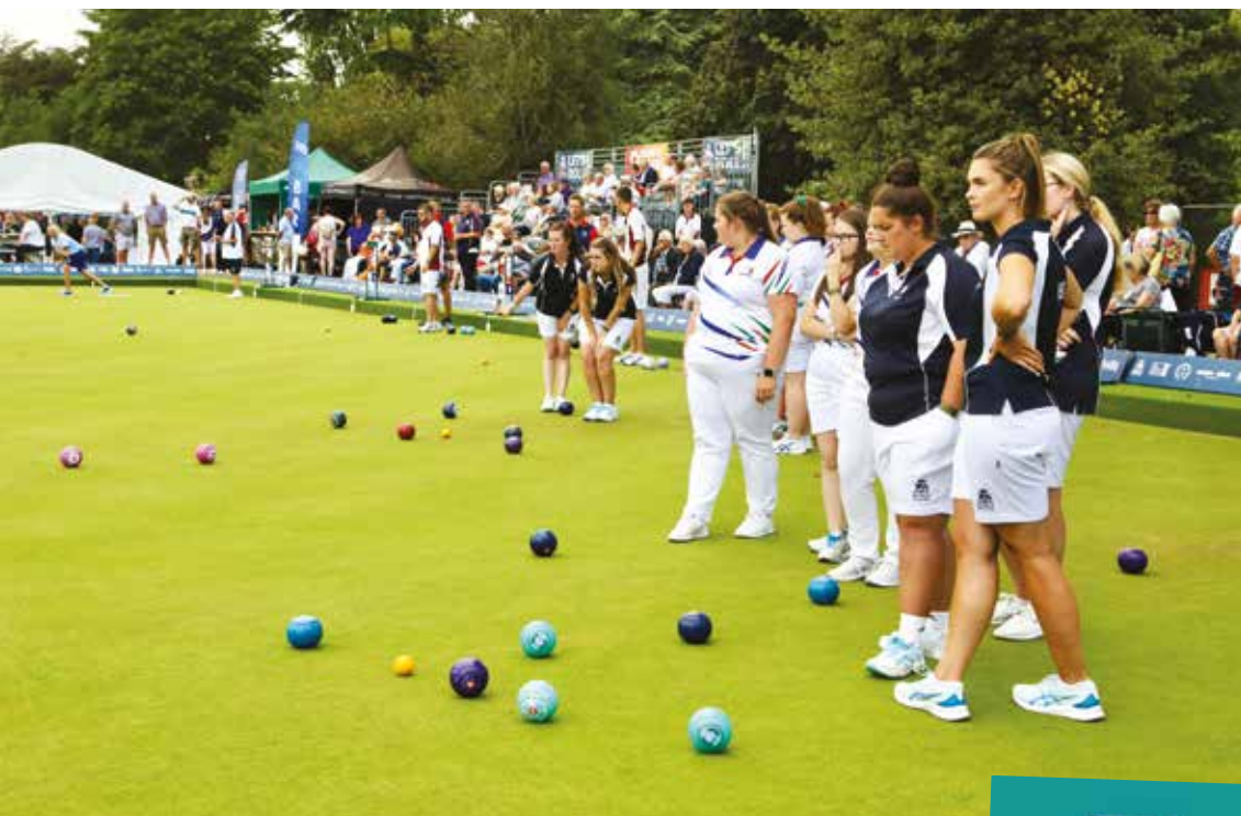
Left: New laws designed to penalise a player who deliberately displaced their own team's bowl on its original course or lifted a bowl at rest to allow one of their own team's bowls to pass had been causing a great deal of confusion